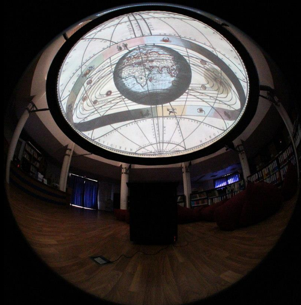
Images: Emerald-LITE dome, real projections